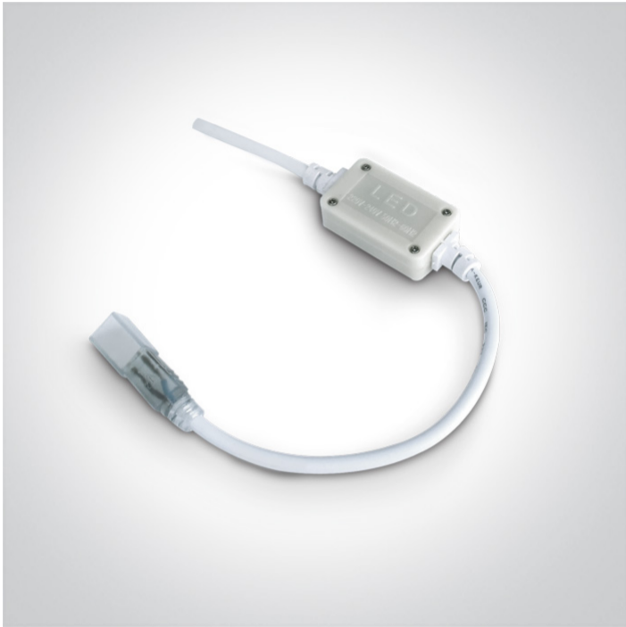
POWER SUPPLY FOR 7860 230v