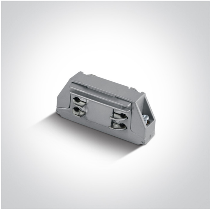
16A Grey connector for track 40003A.