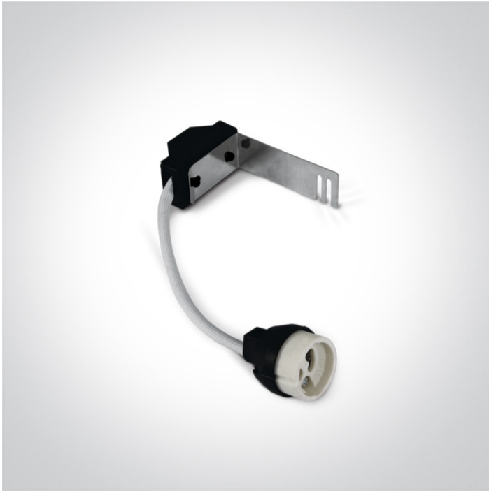
100- 240V GU10 Lampholder Double insulated